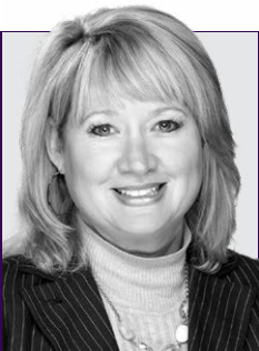
ELESA DOLL BROKER