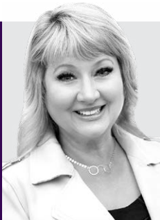
ELESA DOLL BROKER